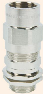
Steel pipe wiring