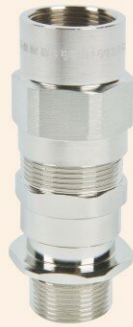
Steel pipe wiring