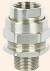
Steel pipe wiring