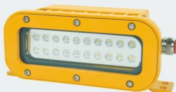
HDL-F Helideck Explosion-proof Floodlight