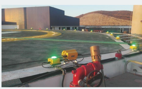
Explosion-proof Perimeter Light