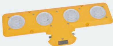
HDL-C Helideck Explosion-proof Circle Light

Ex II 2 G Ex db eb IIC T6 Gb Ex II 2 D Ex tb IIIC T80℃ Db IP66/IP67