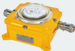
HDL-P Explosion-proof Perimeter Light

Ex II 2 G Ex db eb IIC T6 Gb Ex II 2 D Ex tb IIIC T80℃ Db IP66/IP67