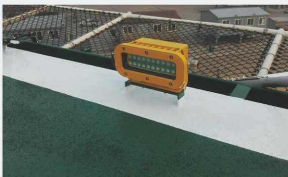
Helideck Explosion-proof Floodlight