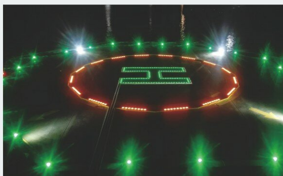
Night View Map of Helicopter Landing Platform Aid System