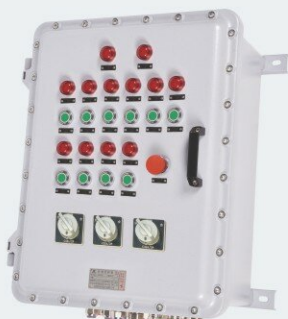
HRMD91 Explosion-proof Distribution Panels