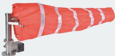
HDL-W Explosion-proof Wind Direction Lamp