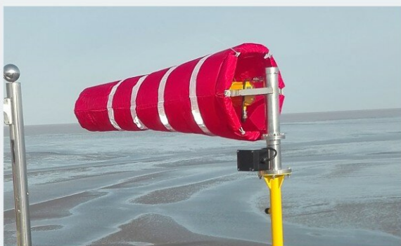
Explosion-proof Wind Direction Lamp