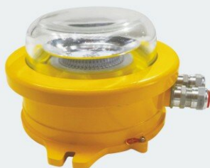
HDL-S Explosion-proof Status Light