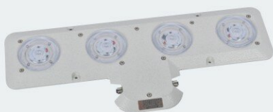
HDL-H Helideck Explosion-proof H Light

Ex II 2 G Ex db eb IIC T6 Gb Ex II 2 D Ex tb IIIC T80℃ Db IP66/IP67